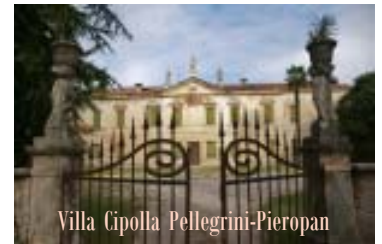
Villa Cipolla Pellegrini-Pieropan