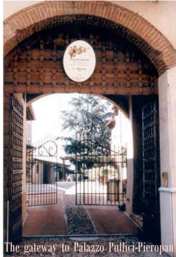
The gateway to Palazzo Pullici-Pieropan

Locations: Soave & Monte Garzon, Province of Verona, Region of Veneto