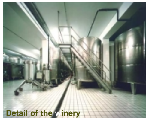
Detail of the winery

Soil characteristics are enhanced by an altitude of 250-500 meters above sea level; vineyard management is painstaking and severe, ensuring crop yields far lower than competing wines'. Needless to say, character and concentration well transcend the minuscule price tags. All wines are 100% from the respective varieties.