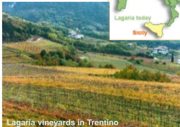
Lagaria vineyards in Trentino