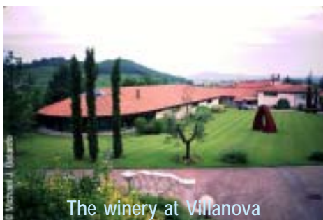
The winery at Villanova

cellars are built like a rural village from the 1700s or 1800s, entirely in natural, local material such as stone and solid wood. They reflect a