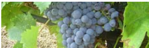
A grape bunch of Montepulciano: the Lamalettos are staunch supporters of indigenous varieties

on clayey-calcareous soil, yielding a mere 2 tons per acre. Ageing is 14 months in French oak barriques and barrels (respectively 225 liters and 7 hl.) , previous to a further minimum of 18 months' bottle age . The fabulous, high-rising terrain and intrinsic varietal nobility yield majestic body and depth, mellow roundness, fleshy complexity and ample, layered flavors of spice and ripe fruit. Unfiltered .