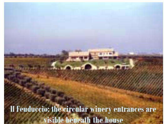
Il Feuduccio: the circular winery entrances are visible beneath the house