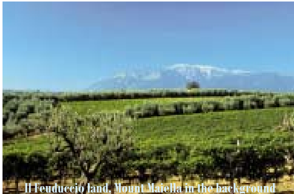
Il Feuduccio land, Mount Maiella in the background

Location: Orsogna, Province of Chieti, Region of Abruzzi