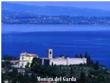
Moniga del Garda

appellations, between Lake Garda and Brescia, form a gently rolling landscape of great charm and tranquillity, rich in historical remains and lovely ancient castles. Geologically, the area goes back to some 70-80 million years ago, when glaciers melted, forming morainic amphitheatres, lakes and hills up to 980-990 feet, made up of around 60 different kinds of soil, from clay to limestone and rock, which supply wines with a wealth of beneficial quality components.